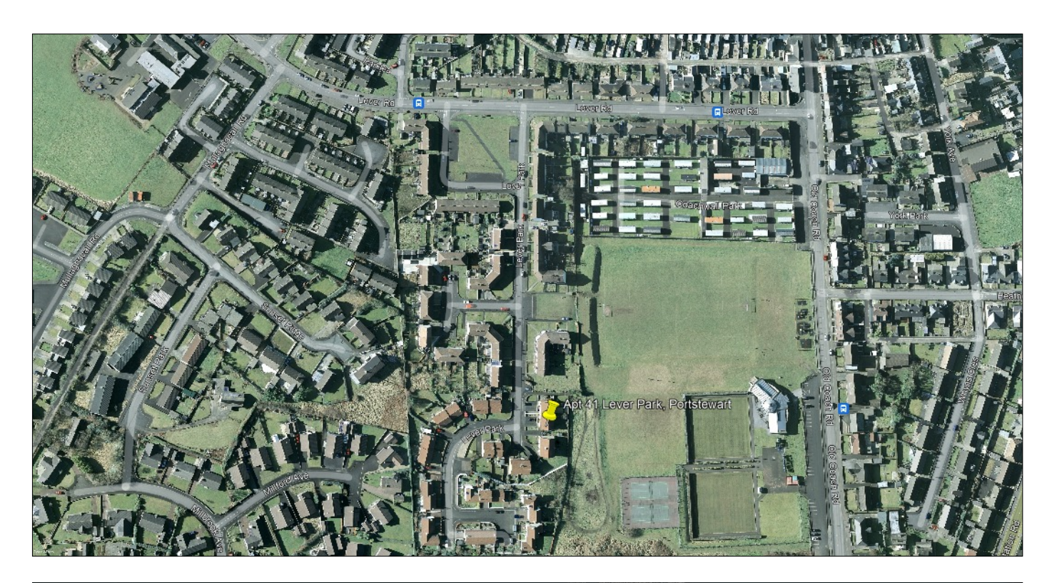
Apt 41 Lever Park, Portstewart BT55 7ES