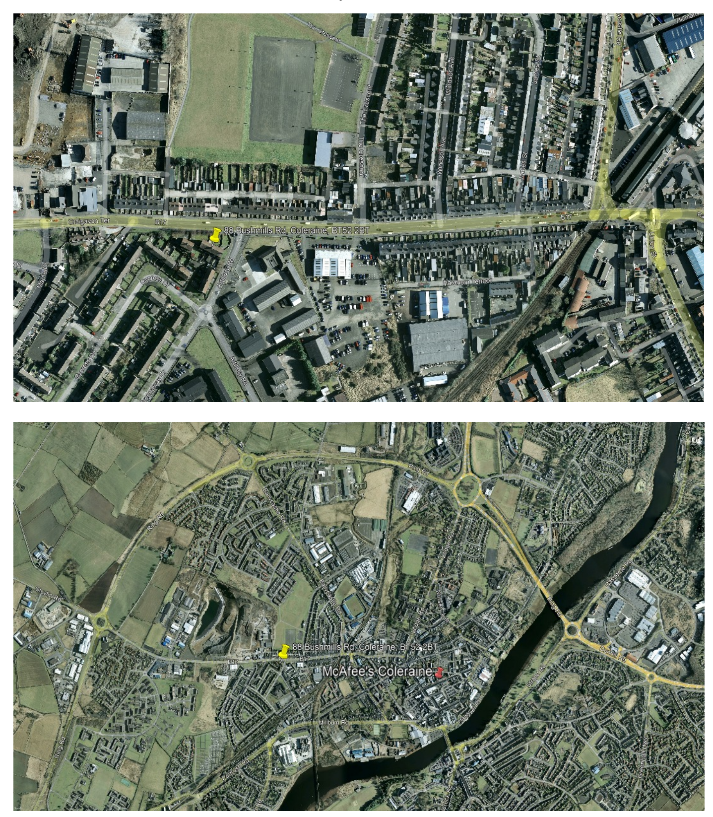
88 Bushmills Road, Coleraine, Co Londonderry, BT52 2BT