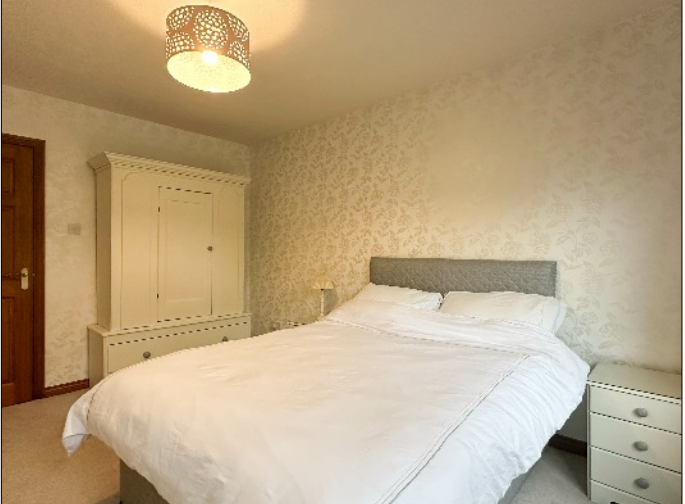
BEDROOM 3: 13' 10" x 8' 7" (4.22m x 2.62m) With television point.