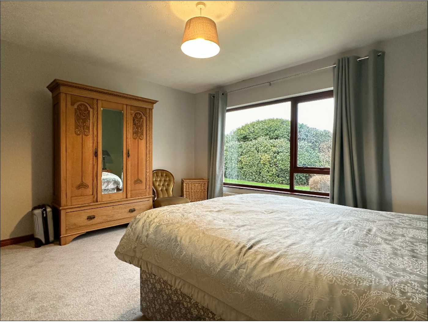
BEDROOM 5: 13' 8" x 12' 10" (4.16m x 3.90m) With television point.