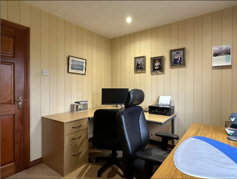
STUDY: 9' 10" x 9' 5" (2.99m x 2.87m) With telephone point, recess lighting.