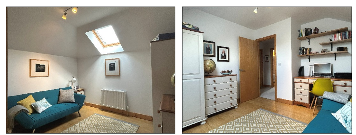
BEDROOM 3: 11' 6" x 10' 6" (3.50m x 3.20m) (MAX) With wooden effect oak flooring, Velux window.