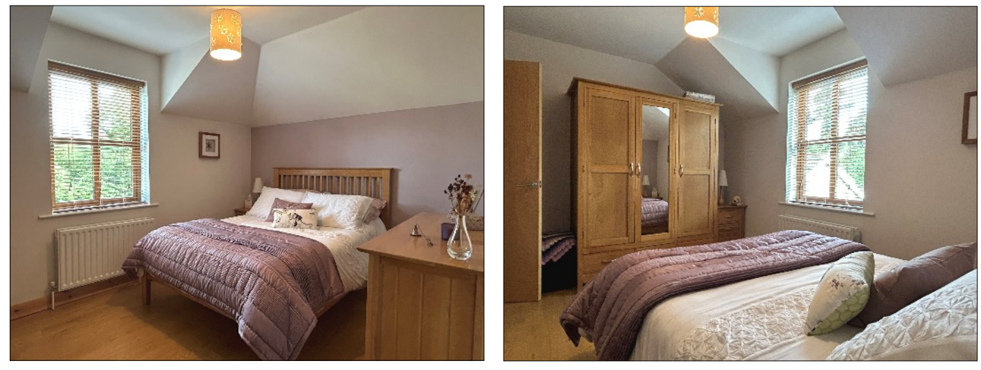
BEDROOM 2: 12' 7" x 9' 5" (3.83m x 2.88m) With wooden effect oak flooring.